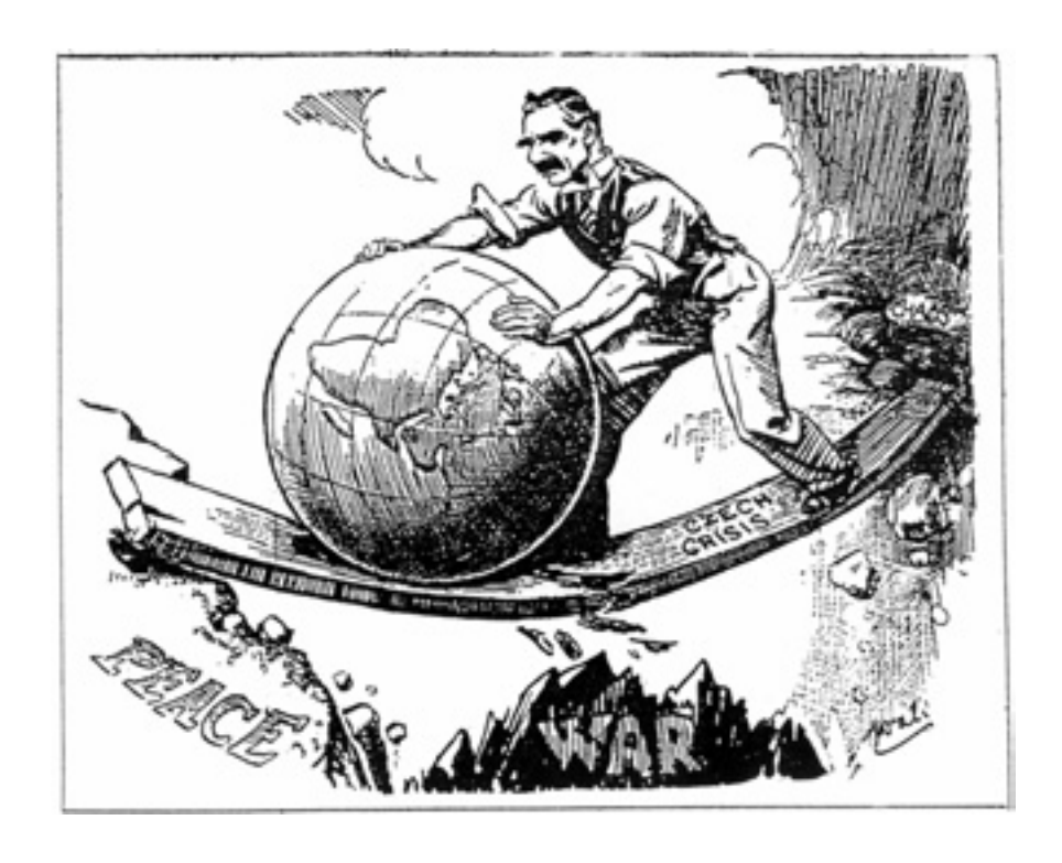
A cartoon published in a British newspaper on 25 September 1938.