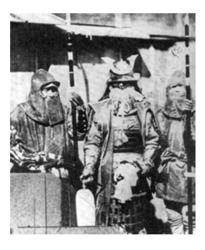
A photograph of Japanese warriors in 1868.