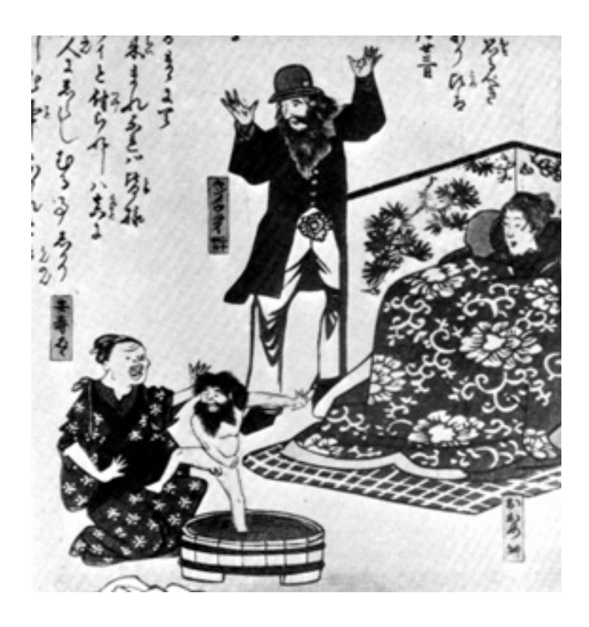
A Japanese drawing from the second half of the nineteenth century showing what would happen if Japanese women married Western men. The child is the result of the marriage.