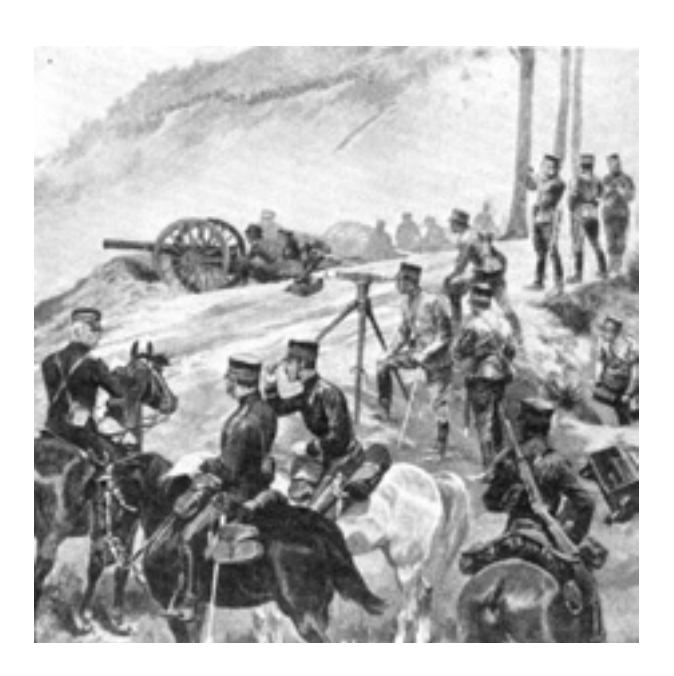
A drawing of Japanese soldiers in 1904.